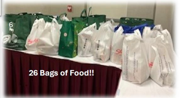
26 Bags of Food!!