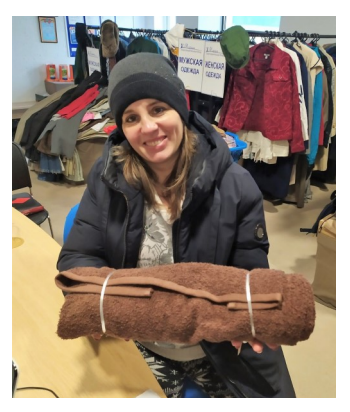
Happy Hygiene Kit recipient

Although well over half the boxes sent contained needed clothing, the pictures show which items gave the most joy. Particular thanks go to two Delaware bike shops, Newark Bike Project and Garrison's Cyclery, who donated the bikes pictured below. We are excited to get back to work so we can send our next shipment.