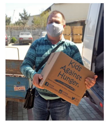
Above: Grateful for KAH meals.

Although well over half the boxes sent contained needed clothing, the pictures show which items gave the most joy. Particular thanks go to two Delaware bike shops, Newark Bike Project and Garrison's Cyclery, who donated the bikes pictured below. We are excited to get back to work so we can send our next shipment.