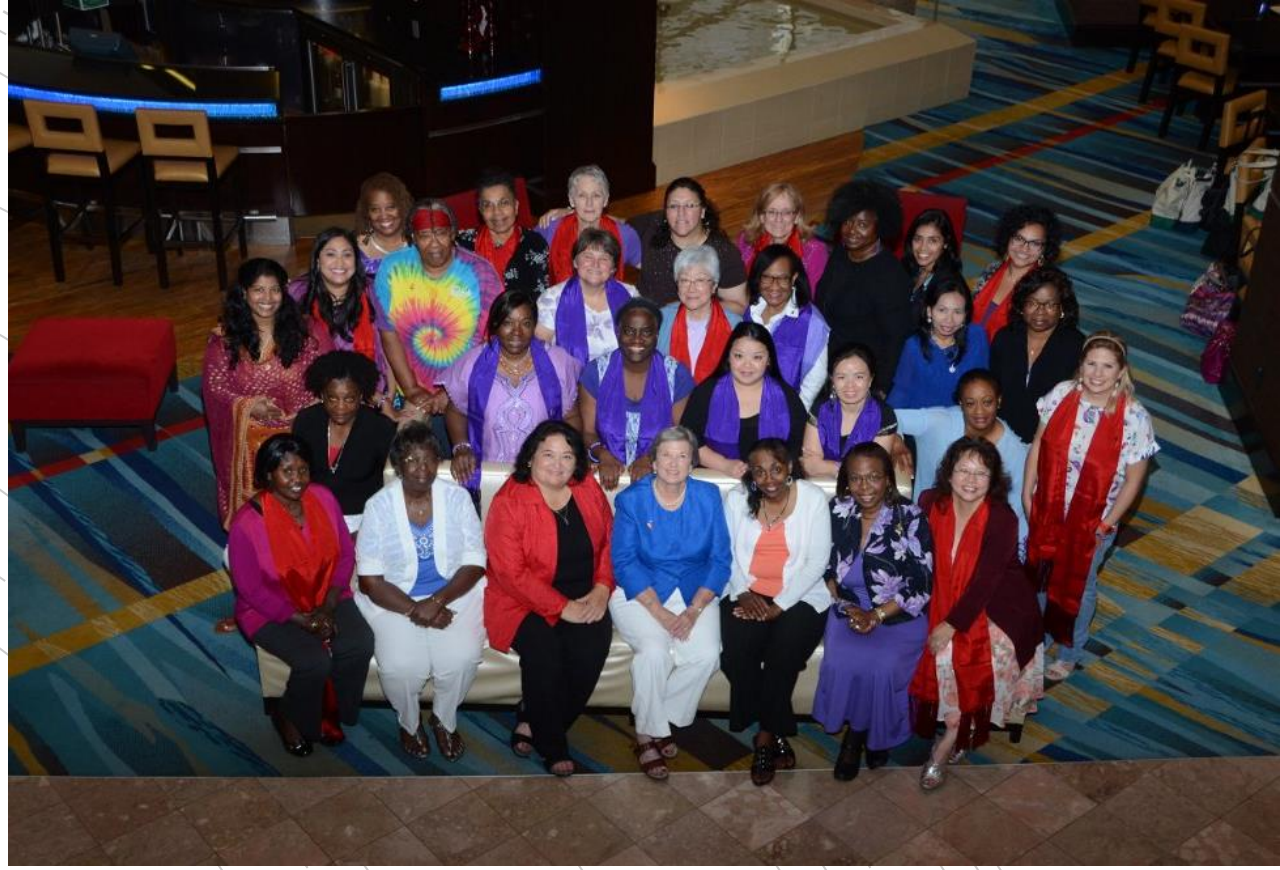
Heart to Heart Sisters Classes of 2015 and 2017